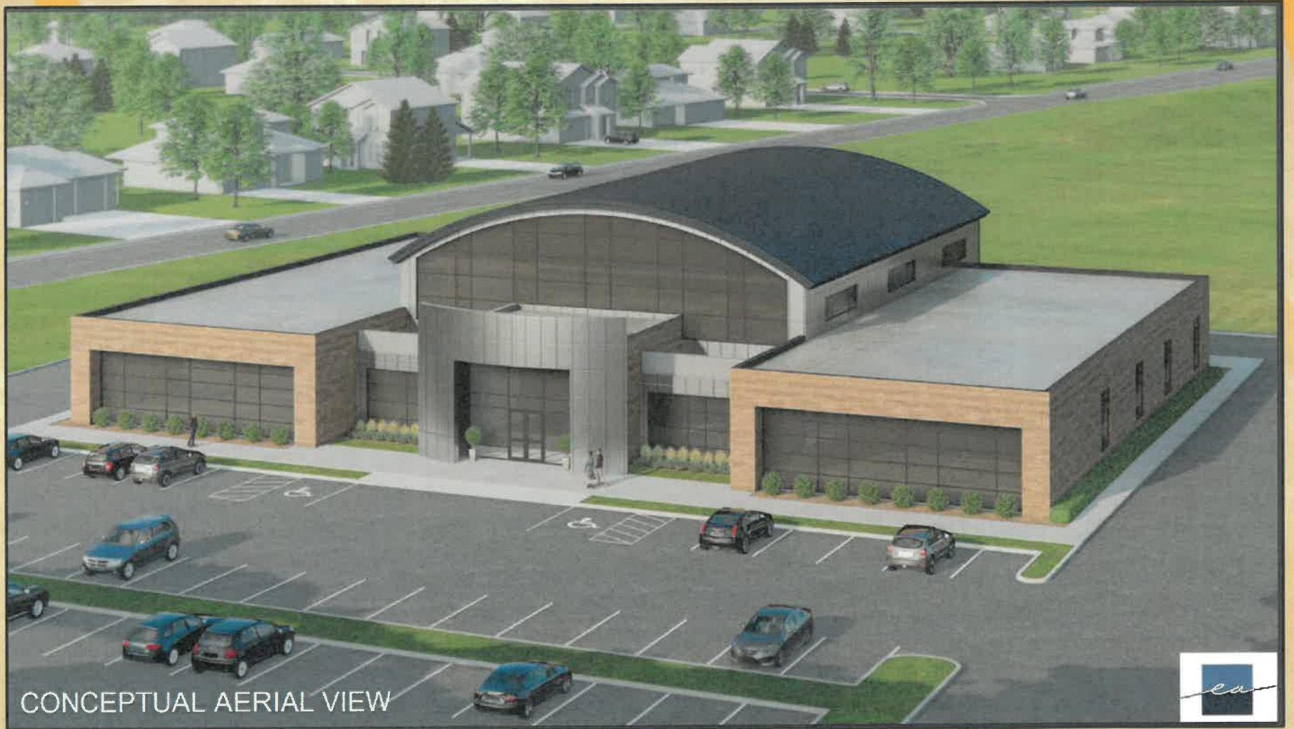
CONCEPTUAL AERIAL VIEW